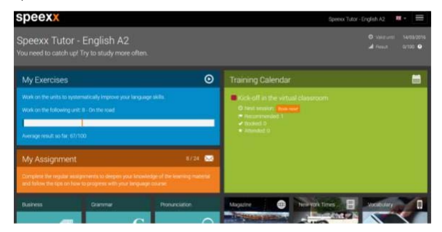
Step 2: Click the Play button in the My Exercises window to begin the units in your study path.

Step 1: Launch the course from within your WV University enrollment list. The Speexx courseware will open in a new browser window.